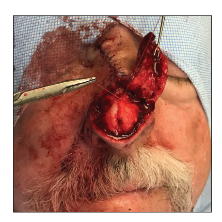
FIGURE 2. Simple interrupted sutures placed into the nasal cartilage to narrow the nose.

Cartilage sutures highlight an underutilized technique in nasal reconstruction, with few cases reported in the dermatologic surgery literature.<sup>3,4</sup> The interdomal suture is placed through the left and right lower lateral cartilages to help narrow and redefine the nasal tip.<sup>5</sup> Reported techniques include simple interrupted suture or horizontal mattress suture. Suture material for nasal cartilage may be permanent (nylon or polypropylene) or long-lasting